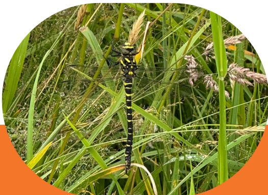
Golden ringed dragonfly

Please remember that the trees will grow again; this is the management style that we have chosen for Penlow.